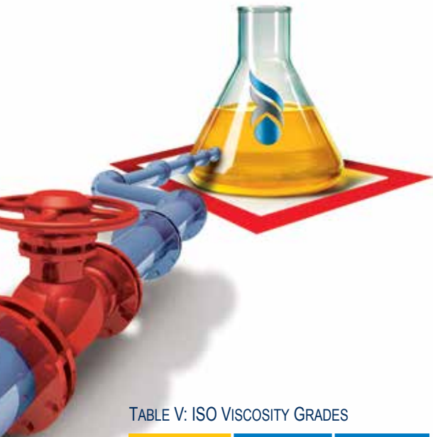
TABLE V: ISO VISCOSITY GRADES